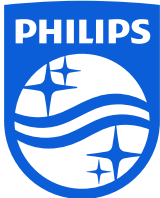
ELE BALLAST (2) F54T5/HO 120-277V